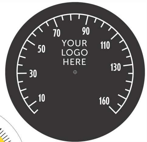
Personalized Dial Artwork

Provides operators with essential technical information for easy installation and replacement.