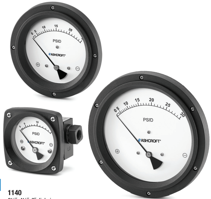
1140 2 1/2", 4 1/2", 6" dial sizes