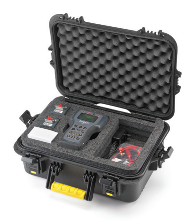
Heavy Duty, Watertight Instrument Carrying / Transport Case. P/N ATE2-CASE