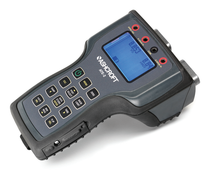
ATE-2 Handheld Calibrator