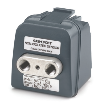
AM2-1 Pressure Module