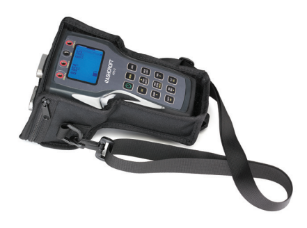
Contoured: Protective Instrument Case with Shoulder Strap. P/N 864D079-01