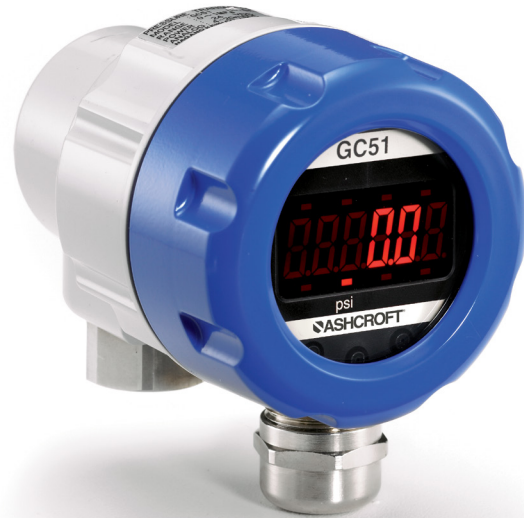
GC51 Pressure Transmitter