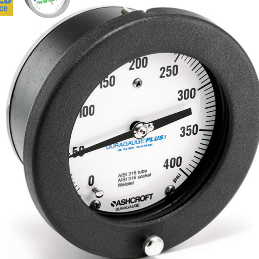
1377 4½" dial size