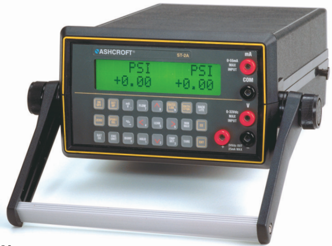
ST-2A Digital Indicator