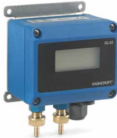
GL42 Differential Pressure Transmitter